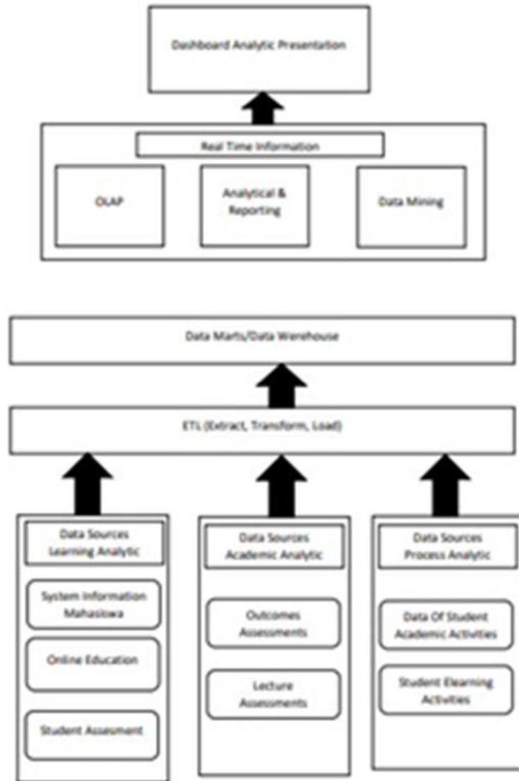
Figure 4. Proposed Plan for Implementing Big Data Analysis