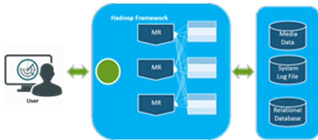
Figure 2. Apache Hadoop Map