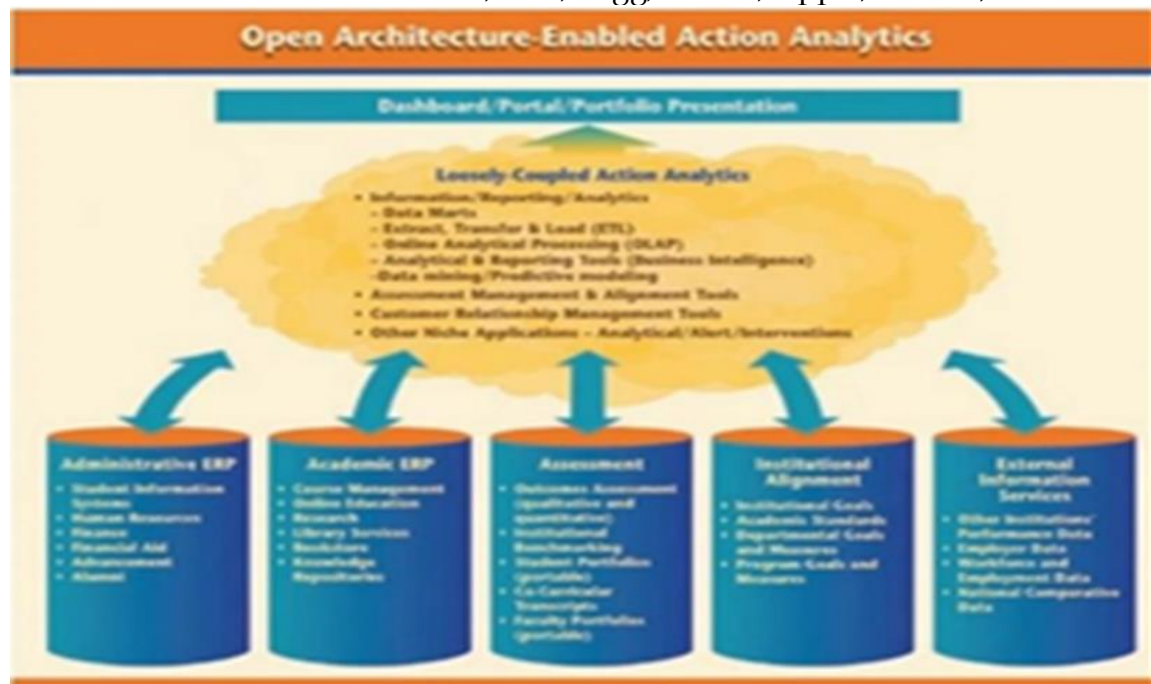
Figure 3. IT Infrastructure for Big Data

Apache Cassandra is a database management product implemented by Apache that is scalable and designed to manage large data across multiple servers. Cassandra is suitable for hybrid and multi-cloud environments. Apart from that, Cassandra's ability to achieve faster performance. Several large companies have used Cassandra such as Facebook, IBM, Digg, Reddit, Apple, Twitter, and others